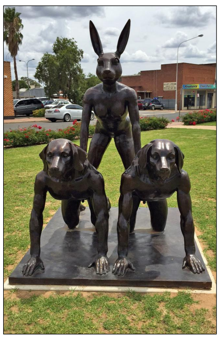
Dog and rabbit statue - Forbes Shire Council.

Street artworks include fixed items such as sculptures. These are visual attractants used to draw attention to a streetscape and they may be used as a unique visual feature such as the Dog and Rabbit statue in Forbes or they may be used to highlight past activities such as the butcher, baker, etc.