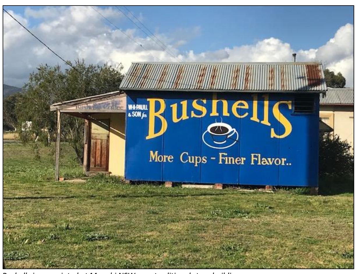
Bushell sign repainted at Moonbi NSW on a traditional store building.

Caution should be made in replication of these art forms across a commercial area, at it moves from a traditional feel to a manufactured feel with no historical background or vibrancy.