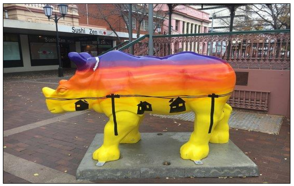
Hippo at Dubbo – TripAdvisor 2020.

Street Art can come in many forms and can range from street performers such as buskers, speaker's lectern, chalk sidewalk artists, permanent and static art works through to sculptures placed along the street areas.