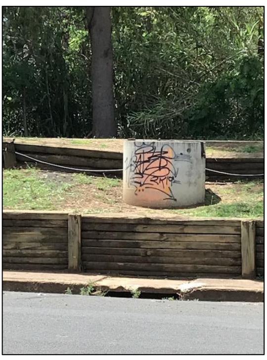
Graffiti in Warren along the proposed River sculpture trail.

Artwork developed and delivered by community organisations allow the community to make a difference to the town appearance, whilst providing valuable art training and skill development. Warren Shire is a sporting Shire but not all youth or adults are sports participants and struggle to fit within the sporting community. Alternate art forms such as urban art allows community participation.