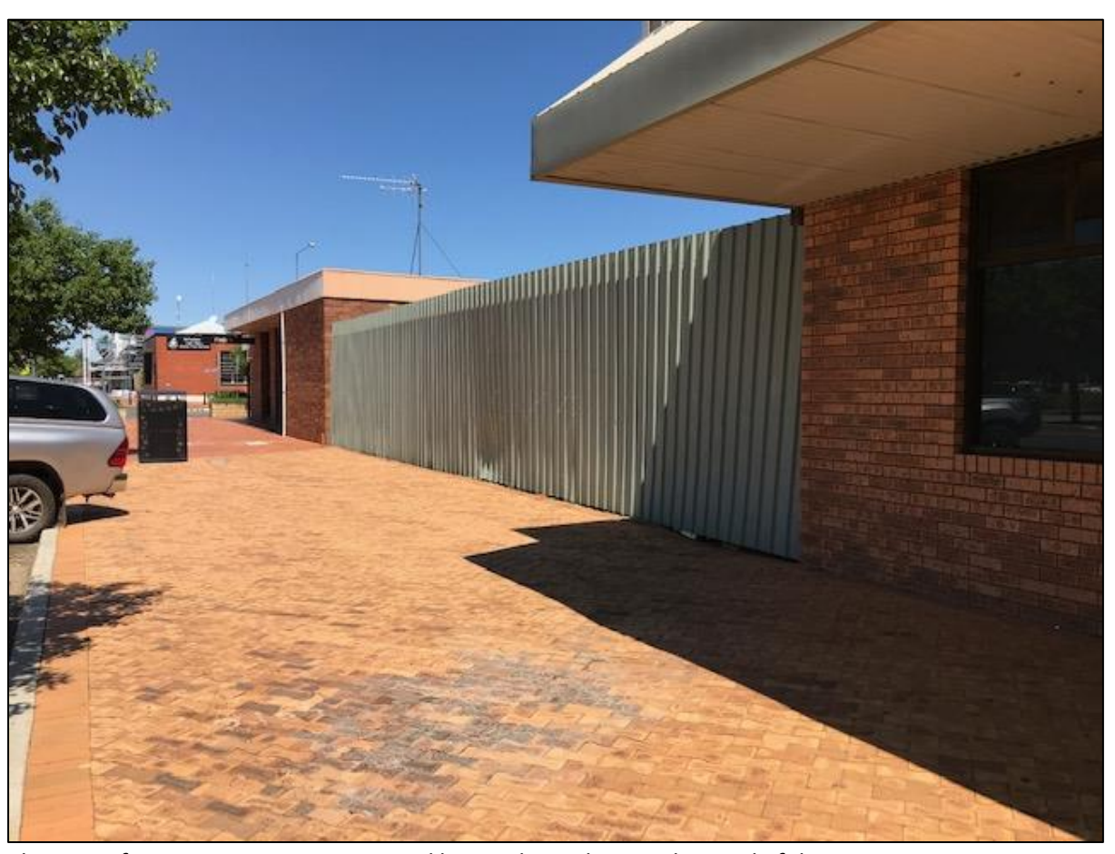
The green fence is very unattractive and brings down the visual appeal of the main street area. Warren Shire identified these fences in its main street upgrade plans, but timing and resources have not allowed the fences to be painted as an attraction.

Rural urban art is an art form like mural painting but with an outcome that beautifies or provides a message to people. This form of art has been used to improve the appearance of electricity boxes, to improve the appearance of fences, toilet blocks and private buildings and in some communities such as Quambone, to enhance a main street through colour and vibrancy.