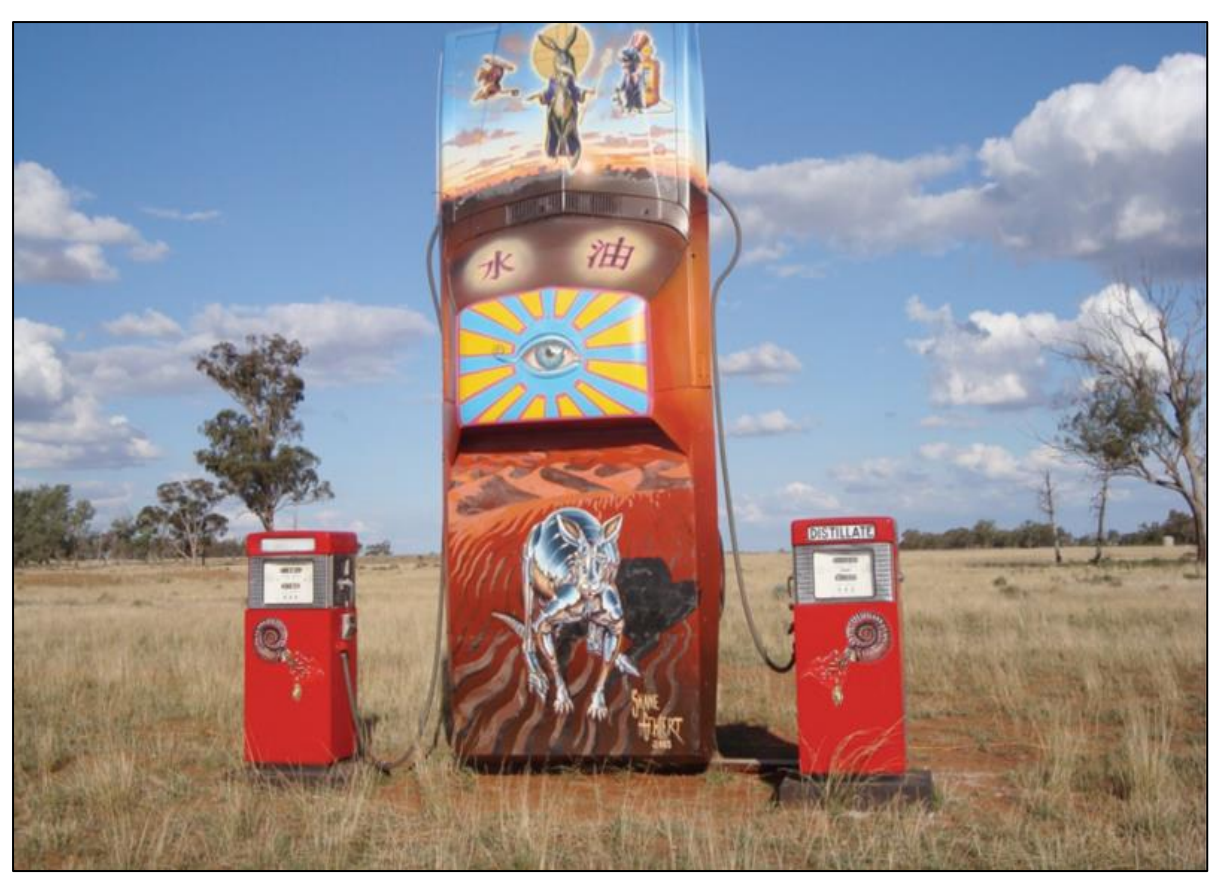
Utes in the Paddock at Condobolin.

The Warren community has an ability to develop a sculpture by the river event. This event would use the accessible footpath from Carter Oval through to Macquarie Park and around the river to the Warren Multipurpose Centre.