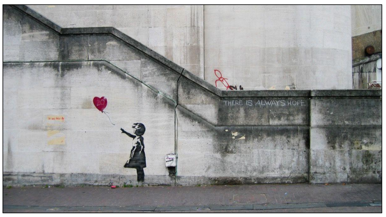
Banksy, Girl with Balloon. Photo by Dominic Robinson, via Flickr. https://www.artsy.net/article/artsy-editorial-6-iconic-works-banksy.

Banksy displays his art on publicly visible surfaces such as walls and self-built physical prop pieces. Banksy no longer sells photographs or reproductions of his street graffiti, but his public "installations" are regularly resold, often even by removing the wall they were painted on. Wikipedia, October 2020.