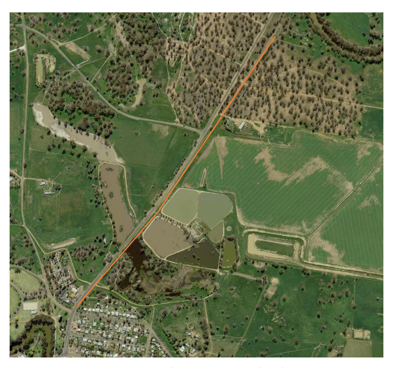
3.3 Community Art Competitions, and Community Festivals and Events

To accelerate the development of public art, the Shire community should look at the development of community art competitions and link these to education, training and artist workshops. Further that festivals and events can be created that develop art forms including music, dance or competitions such as eisteddfods.