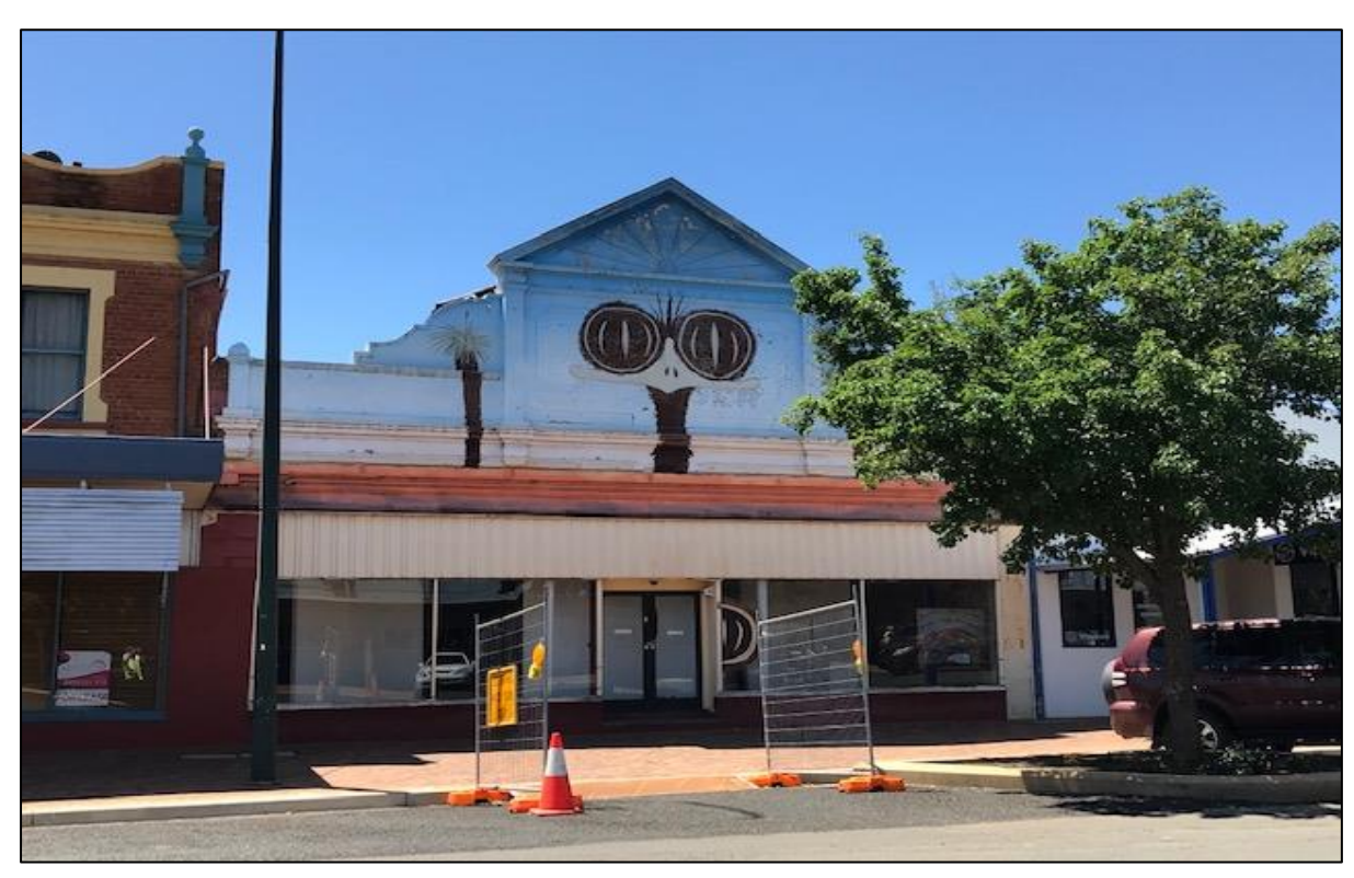
Emu Painted on what was once an art gallery and soon to be museum building