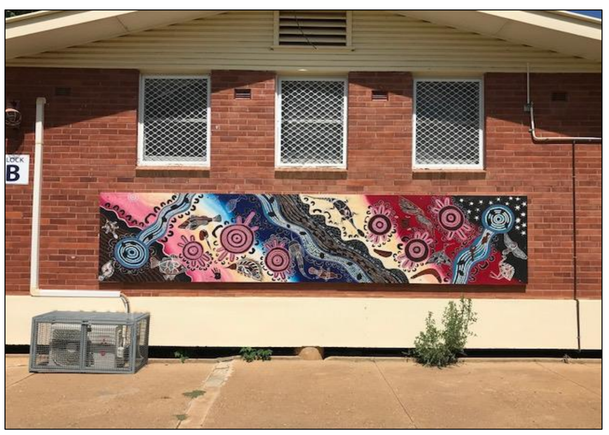
Mural painted on Block B at Warren TAFE – using artwork to brighten a plain brick wall.