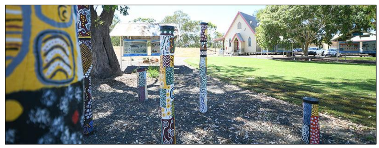
Cultural Art Display at WoW Centre. https://www.warren.nsw.gov.au/discover/window-on-the-wetlands-centre.

The community has several facilities that have been and are being used for art shows and meeting places. These have ranged from central main street areas, to the Warren Show, and the current art venue being the WoW Centre (Windows on the Wetland Centre) leased from Council by RiverSmart.