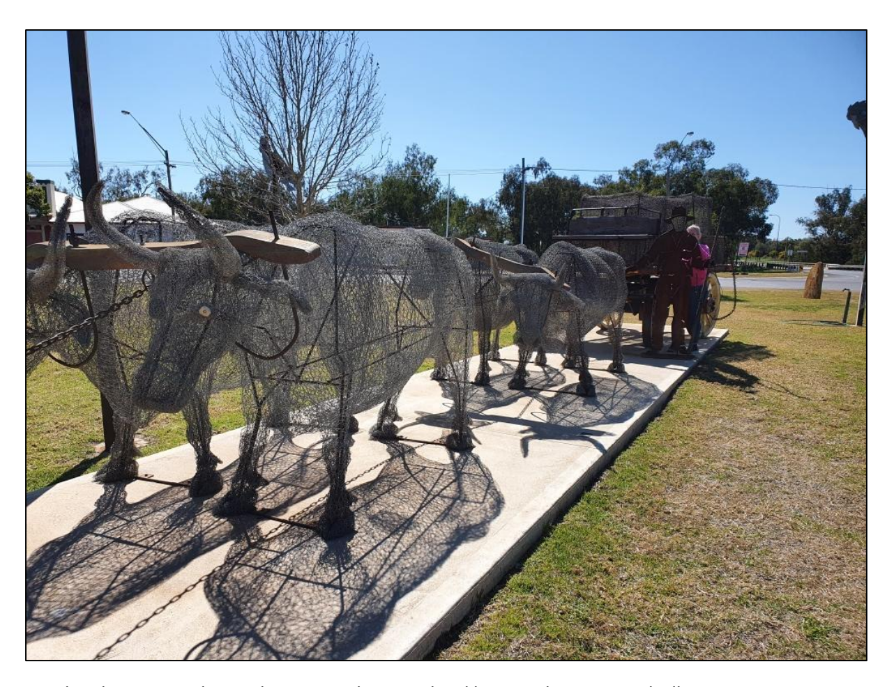
Rural sculpture at Gulargambone NSW, bringing local history alive in a rural village.

Cultural change has been developing over many years and progressive communities have been developing sculpture competitions that attract art works of many varying types that are displayed, promoted and used to enhance economic development.