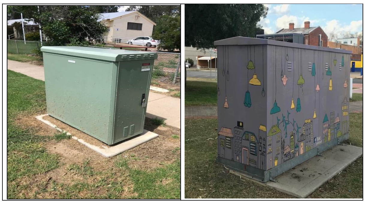
A plain electricity box outside Warren TAFE versus An electricity box in Tamworth. The rural urban art has turned an unattractive box into an artwork in the middle of a community space.

Artwork developed and delivered by community organisations allow the community to make a difference to the town appearance, whilst providing valuable art training and skill development. Warren Shire is a sporting Shire but not all youth or adults are sports participants and struggle to fit within the sporting community. Alternate art forms such as urban art allows community participation.