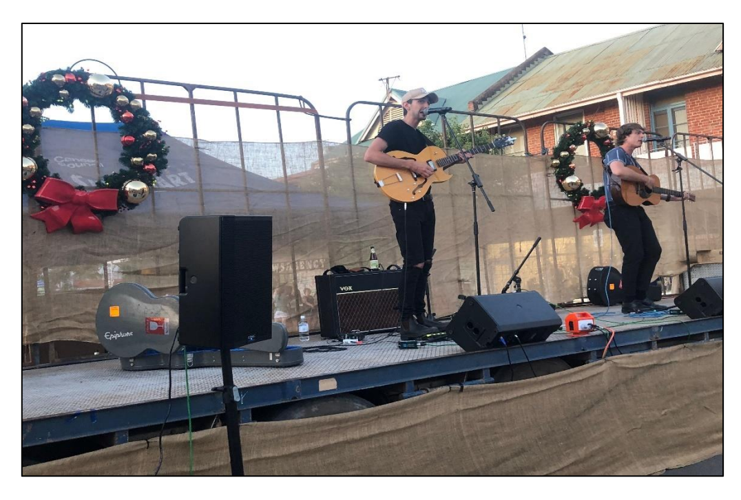
Music in Dubbo Street December 2018

Festivals and events should be targeted as much towards local residents as it is to attract tourists to ensure that everyone has an opportunity to participate in public arts events and seek enjoyment from the event.