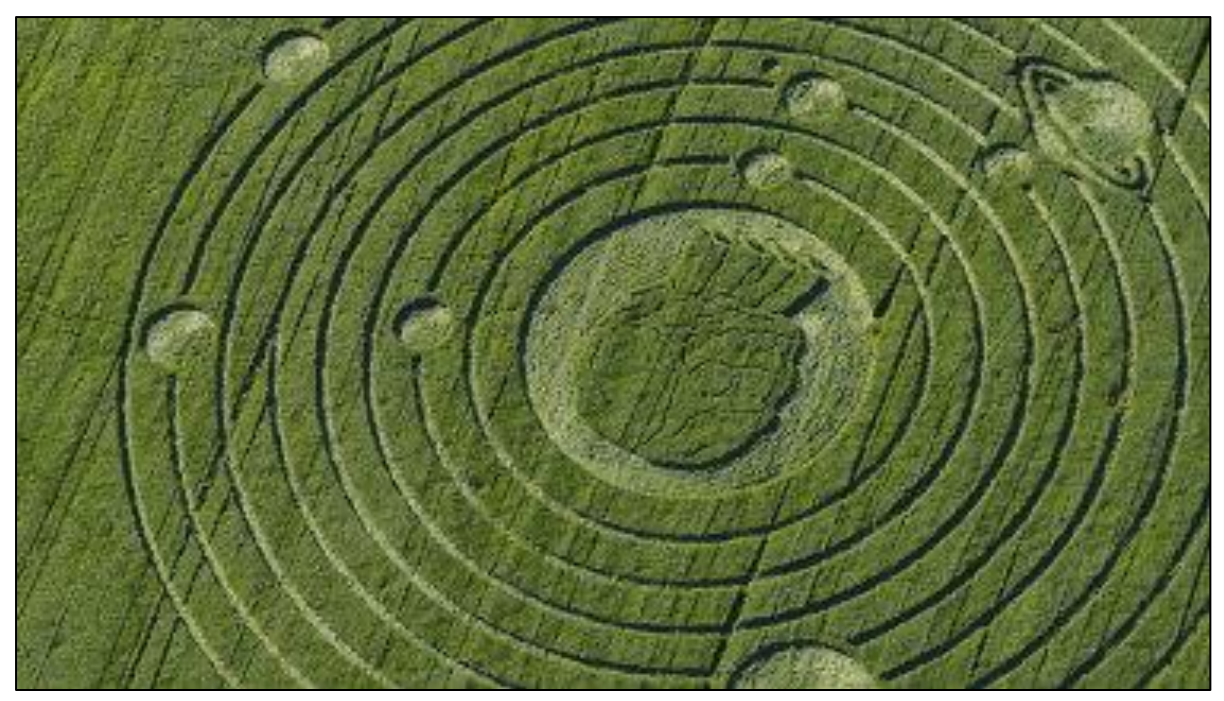
A crop circle in the Hunter Valley. Its design represents the position of the planets at the exact moment of our winter solstice in 2014. https://www.smh.com.au/national/architect-who-became-top-authority-on-mysterious-crop-circles-20200720-p55dqj.html

Landmark art works include place recognition and can include images, architectural designs and colours to attract attention and draw the visitor or resident into an area. Landmark art dominated the local landscape within the Wayilwan Nation prior to European arrival. The traditional Wayilwan people created public art in the form of carved trees. The complex designs, involved skill and strength and held unique and significant meaning for ceremonies and the commemoration of esteemed people within the nation who had passed away. There were thousands of such carved trees prior to European arrival. Examples of such local public art are held at the Warren Local Aboriginal Land Council.