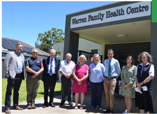
Council, RFDS, WHAC and RARMS representatives at the official health service handover.