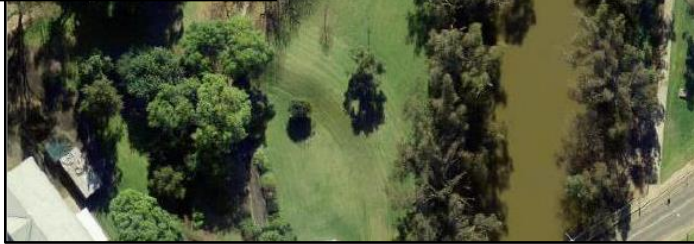
Aerial photo of Macquarie Park

Project 3 – Macquarie Park Revitalisation